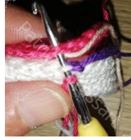
Photo is from one of my other patterns, but the principle remains the same.

Place the sole with good side below, against the sole of the shoe. Crochet the two soles together as follow; take the next stitch one the sole AND the first remaining loop of the shoe (see photo), *slst*, repeat ** to end of round. Close round with a slst in the 1 e st and FO . Do'n forget to put the cardboard in between!!!