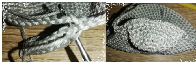
Attaching the cheek