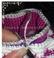
join skirt with the body