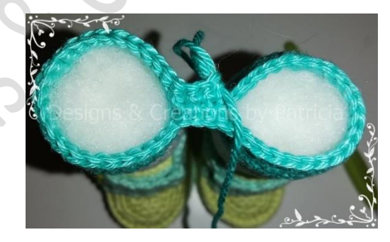
Photo is from a different pattern of mine, but the principle remains the same.

Rnd 01: continue second leg, 8sc (these are not included in the final total), Ch 3, take the first leg and continue in the marked stitch as follow, 1sc (the legs are now joined), 23sc on this leg, 1sc in each chain (=3) 24sc on the other leg, 1sc on each chain (also 3), mark the last stitch as end of round. (54)