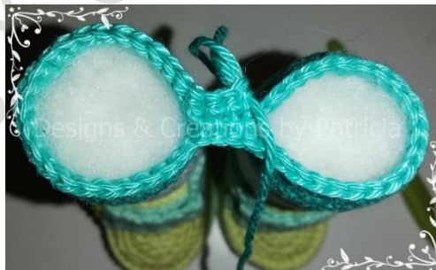
Photo is from a different pattern of mine, but the principle remains the same.

Rnd 01: continue second leg, 8sc (these are not included in the final total), Ch 3, take the first leg and continue in the marked stitch as follow, 1sc (the legs are now joined), 23sc on this leg, 1sc in each chain (=3) 24sc on the other leg, 1sc on each chain (also 3), mark the last stitch as end of round.(54)