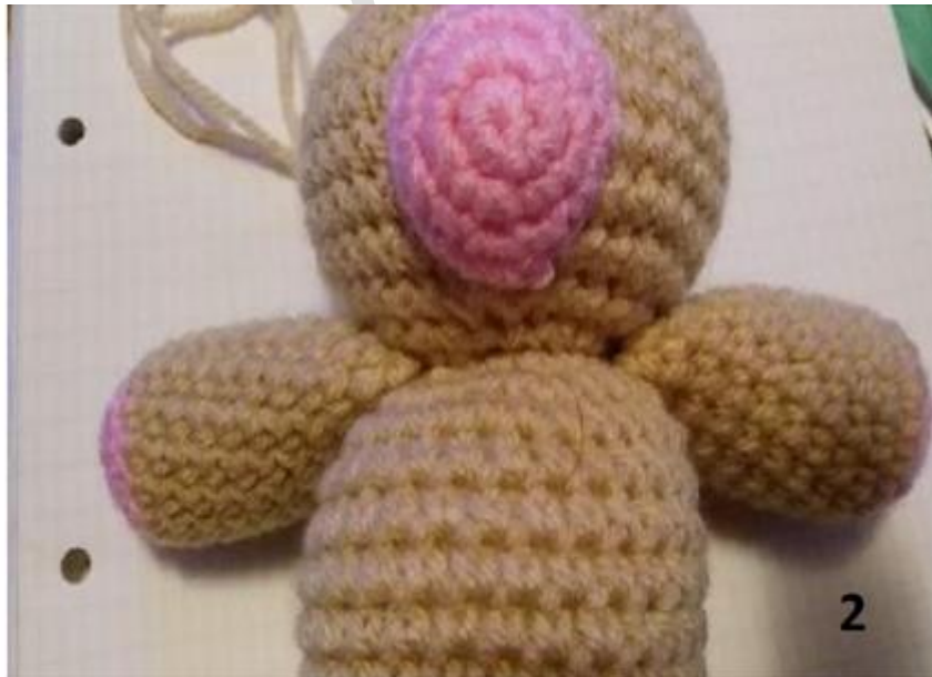
Photo 2 is how it should look like after attaching the arms.