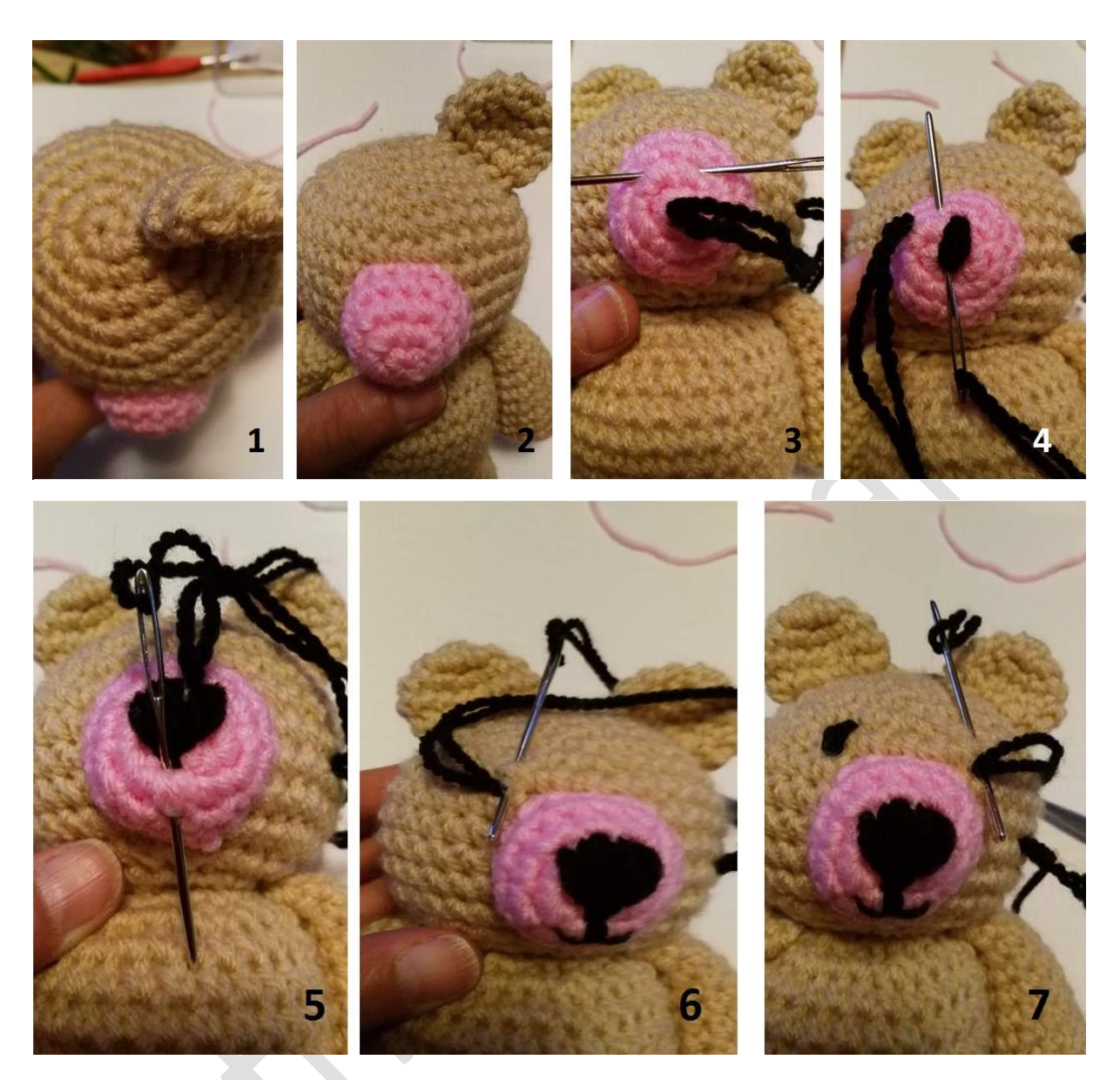
Sew the ears onto the head. Use Photo 1 & 2.

Embroider the nose onto the muzzle Photo 3 & 4 & 5.