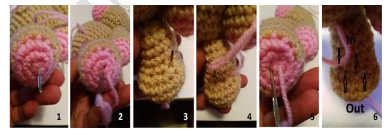
Take a pink thread and bring it into the body and come out in the center of the foot (Photo 1).

Sew on the second leg the same way as the first. After the second time, come out at the same place as the thread of the first leg (on the back). Make a knot with both ends and weave in the loose ends.