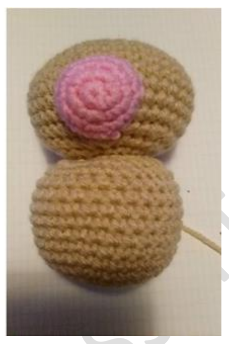
This is how it should look after sewing together.