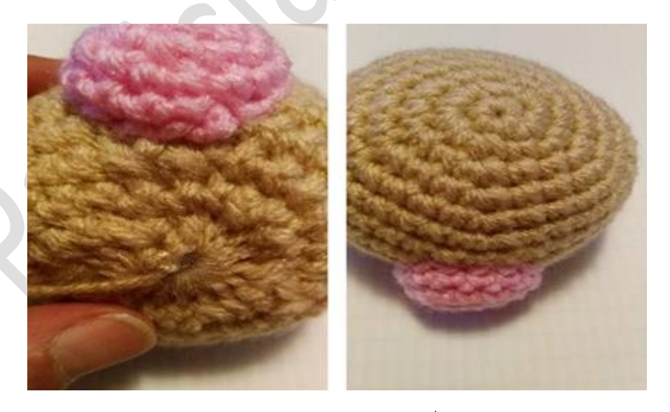
Sew muzzle on to the head, between the 3^{\rm rd} row from the bottom and the 7^{\rm th} row from the top. Stuff slightly.