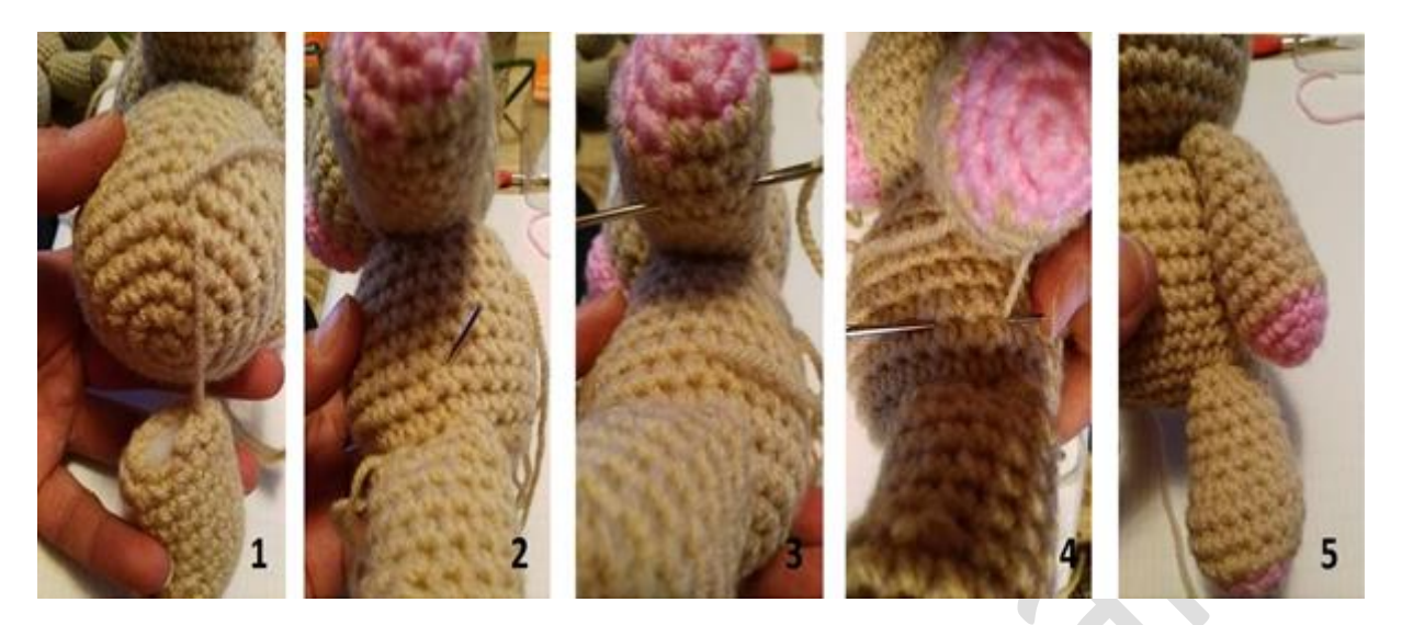
Sew the legs on to the body between the 5<sup>th</sup> and the 6<sup>th</sup> row, counting from the bottom of the body. Use each stitch to attach them (Photo 1).

After attaching each stitch, bring up the needle underneath the arm (Photo 2).