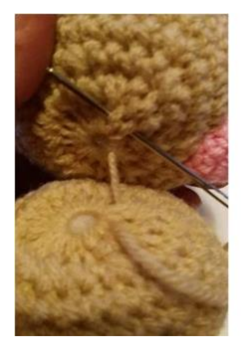
Sew head to body, using the first row of each end.