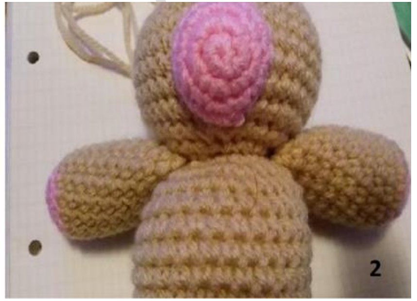
Sew the arm on to the body, using first row (Photo 1). Use each stitch from the arm. Make sure you have positioned them correctly. Do this with both arms. Photo 2 is how it should look like after attaching the arms.